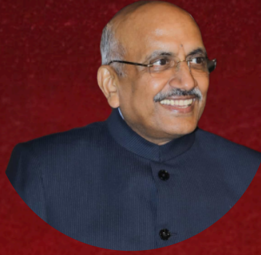
Hon'ble Justice Hemant Gupta Chairperson (Former Judge of Hon'ble Supreme Court of India)